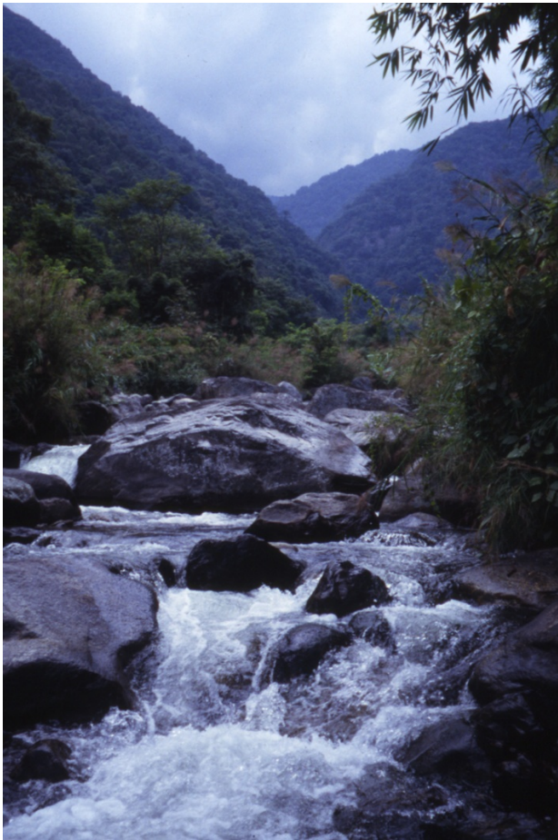
Figure 4 Manggang River at the type locality of Exostoma gaoligongense sp. nov.

Hora & Silas (1952) recognized five valid species among the nominal species of Exostoma at that time, and of the five, one is included in a different genus now, namely Pseudexostoma yunnanensis . Exostoma labiatum was described from the Mishmis Hills of Assam [larger area of earlier times], India (McClelland, 1842) or known as Danbajiang, Tibet, China (Wu & Wu, 1992), and later was reported from other sites in the Brahmaputra and Chindwin river drainages of India (Hora & Mukerji, 1935; Hora & Silas, 1952), Brahmaputra River drainage of Tibet (Wu et al., 1981; Wu, 1985; Wu & Wu, 1992), and rivers in the Irrawaddy River drainage of Yunnan (Chu & Mo, 1999; Chu et al., 1990; Wu et al., 1981). Exostoma berdmorei was described from Tenasserim, southern Myanmar (Blyth, 1860; Hora & Silas, 1952), the second collection was from Dawna Hills, Kawkaik, Sukli, Kayin State, Myanmar, in 31 October 1934 (Fishbase-on-line). A small collection of Dr. Tyson Roberts kept in CAS from Salween drainage was examined for this study. From its forked caudal-fin, apparent small gill opening and only 14 branched caudal-fin rays, these fishes match very well characters of E. berdmorei in Hora & Silas (1952). It differs from description of Hora & Silas (1952) in the following characters: nasal barbel reaches eye or not vs. not