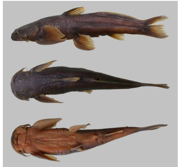
Figure 1 Holotype of Exostoma gaoligongense sp. nov. (KIZ 200310738); lateral (top), dorsal (middle), and ventral (bottom) views