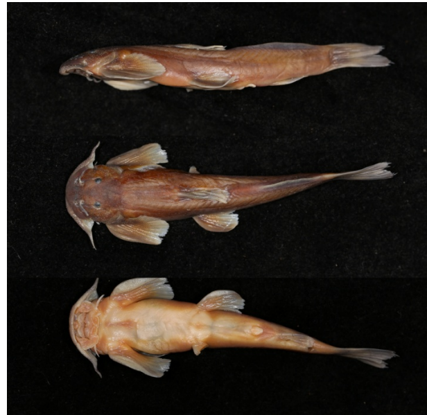
Figure 5 Exostoma vinciguerrae (SEABRI-20150257), 56.9 mm SL, from Zeyar Stream, Hponkanrazi Wildlife Sanctuary, 9 Dec., 2015; lateral (top), dorsal (middle), and ventral (bottom) views

Hora & Silas (1952) recognized five valid species among the nominal species of Exostoma at that time, and of the five, one is included in a different genus now, namely Pseudexostoma yunnanensis . Exostoma labiatum was described from the Mishmis Hills of Assam [larger area of earlier times], India (McClelland, 1842) or known as Danbajiang, Tibet, China (Wu & Wu, 1992), and later was reported from other sites in the Brahmaputra and Chindwin river drainages of India (Hora & Mukerji, 1935; Hora & Silas, 1952), Brahmaputra River drainage of Tibet (Wu et al., 1981; Wu, 1985; Wu & Wu, 1992), and rivers in the Irrawaddy River drainage of Yunnan (Chu & Mo, 1999; Chu et al., 1990; Wu et al., 1981). Exostoma berdmorei was described from Tenasserim, southern Myanmar (Blyth, 1860; Hora & Silas, 1952), the second collection was from Dawna Hills, Kawkaik, Sukli, Kayin State, Myanmar, in 31 October 1934 (Fishbase-on-line). A small collection of Dr. Tyson Roberts kept in CAS from Salween drainage was examined for this study. From its forked caudal-fin, apparent small gill opening and only 14 branched caudal-fin rays, these fishes match very well characters of E. berdmorei in Hora & Silas (1952). It differs from description of Hora & Silas (1952) in the following characters: nasal barbel reaches eye or not vs. not