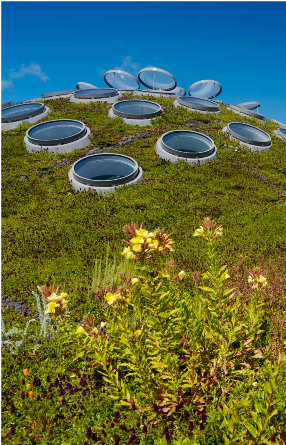
Flowers attract insects and birds that pollinate the native plants on the Academy's Living Roof.

Whatever your company profile, you'll find an opportunity to advance the Academy's mission—and enjoy the benefits of a closer connection. For more information, please contact the Director of Corporate Support at 415-379-5409 or rschuett@calacademy.org , or visit us online at www.calacademy.org/give/corporate_giving .